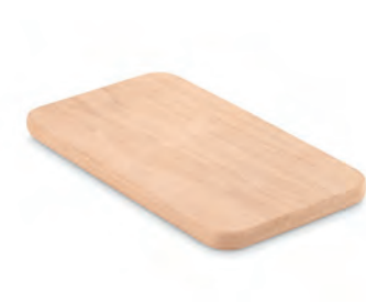
Petit Ellwood MO8860 Small cutting board manufactured in EU from Alder wood. Made from 1 piece of wood, 100% natural.