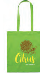
Cottonel Colour + MO9268

Cotton shopping bag with long handles. 140 gr/m 2 . Produced under a certified standard for the use of harmful substances in textile.