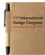
Cartopad MO7626 Recycled paper notebook with matching pen. Soft paper cover with pen holder. Casebound. 160 lined pages (80 sheets). Matching push button ball pen in recycled carton and biodegradable plastic. Blue ink.