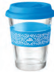
Astoglass MO9992 Glass tumbler with silicone lid and grip. Capacity 350 ml. As this is a single wall mug heat transfer can still occur.