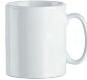
Whitie KC8040 Classic cylindrical ceramic mug of 300 ml mug. Individual packaging in corrugated carton gift box.