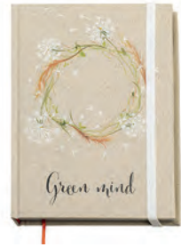
NOTE55 NOTE55 Hard cover A5 notebook with hard cover made of recycled paper containing graas fibers.