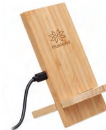
Whippy Plus MO6277

Bamboo lunch box with removable divider and attachable elastic nylon strap. Dry food only. Capacity: 650ml.