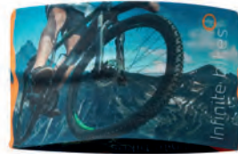
MH3101 MH3101 Full colour RPET headband