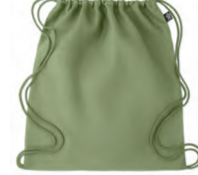
Naima Bag MO6163 Drawstring bag in 100% hemp fabric. 200 gr/m 2 .