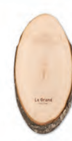
Ellwood Runda MO8862 Oval cutting board with bark manufactured in EU from Alder wood. Made from 1 piece of wood, 100% natural. Sizes may vary between each product.