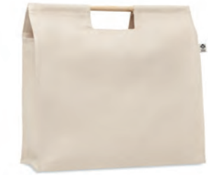
Mercado Top MO6458

Certified organic cotton shopping bag with long handles. A classic tote bag design made to carry your daily groceries or other items. Carry the bag in your hands or over your shoulder with the long handles. Made from 100% natural organic cotton 140 gr/m 2 .