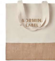
India Tote MO9518

Jute shopping and cooler bag with long handles, laminated and with hook and loop closure, front with canvas pocket and cotton webbing.