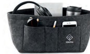
Nizer MO6334 RPET felt travel organizer with 2 inner and 4 outer compartments.