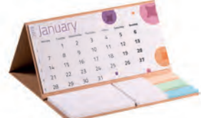
CALECO CALECO Recycled CalendoNote hard cover.