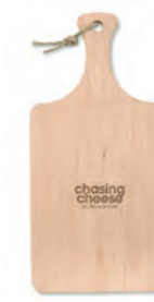
Ellwood Lux MO9624 Cutting board with handle and cord hanger, manufactured in EU Alder wood.