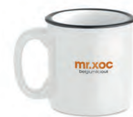
Tweenies MO9243 Ceramic vintage style mug of 240 ml capacity. Individual packaging in white carton box. Ceramic transfer is dishwasher safe.