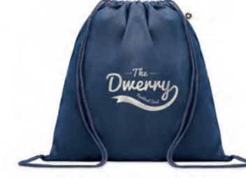
Style Bag MO6422

2 tone recycled cotton and recycled polyester shopping bag with drawstring and long handles. Approx. 140 gr/m 2 . This item can shrink after printing.