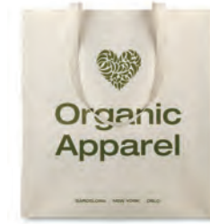
Organic Cottonel MO8973

Organic cotton shopping bag with long handles. 105 gr/m 2 . Made from organic cotton produced under a certified label.