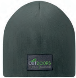
MW1101 MW1101 Double layer beanie. 50% rPET + 50% acrylic, 55 grams.