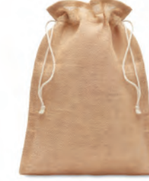
Jute Medium MO9929

Large gift jute draw cord bag. Size approx. 30 x 47cm.