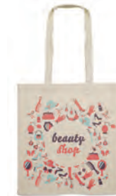
Cottonel + MO9267

Cotton shopping bag with short handles. 140gr/m 2 . Produced under a certified standard for the use of harmful substances in textile.