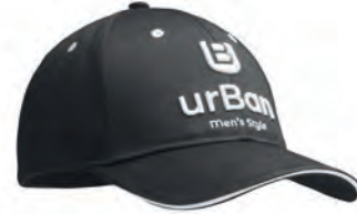
MH2103 MH2103 Recycled PET fabric Cap heavy cotton with sandwich.