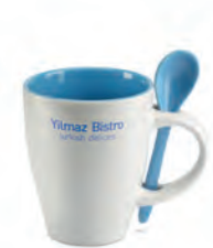
Dual MO7344 Bicolour ceramic coffee mug of 250 ml capacity with colour matching spoon. Individual box 11,5x10,5x9,3cm.