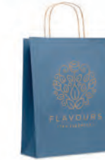
Paper Tone M MO6173

A6 recycled carton cover notebook. Sewn. 160 plain recycled paper pages (80 sheets).