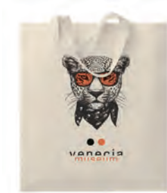
Marketa + MO9847

Cotton shopping bag with short handles. 140gr/m 2 . Produced under a certified standard for the use of harmful substances in textile.