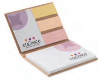
COMBE1 COMBE1 Recycled Hard cover ComboNote (106x77mm, closed) with recycled sticky notes (80gsm) of 100x72mm and 50x72mm; and recycled markers in 3 different colours.