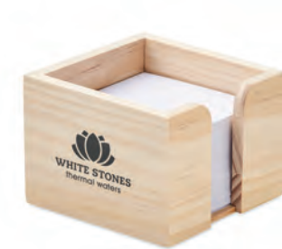
Sequoia MO6482 Bamboo memo cube dispenser with white plain sheets memo block. 600 white plain sheets (70 gsm / 9x9 cm).