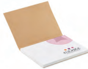
SNES50 SNES50 Recycled soft cover sticky note (size 100x72mm, closed) with 50 sticky notes of recycled white paper (80gsm).