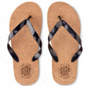
Bombai L MO6403

Cork 14 inch laptop bag with magnetic closure flap.