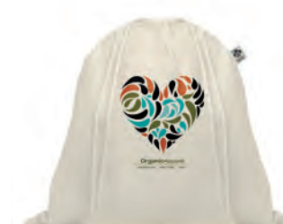
Organic Hundred MO8974

Organic cotton drawstring bag. 140 gr/m 2 . Made from certified organic cotton.