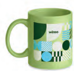
Dublin Tone MO6208 Classic ceramic coloured mug in box. Capacity 300 ml.