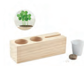
Thila MO6408 Wooden desk stand with pen and phone holder and clover seeds.