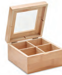
Campo Tea MO9950

Bamboo tea box with transparent glass lid. Within the 4 equally divided compartments you can easily hold up to 24 teabags. Bamboo is a natural product, there may be slight variations in colour and size per item, which can affect the final decoration outcome.