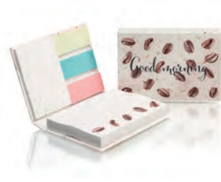
COMBC1 COMBC1 Coffee paper hard cover ComboNote.