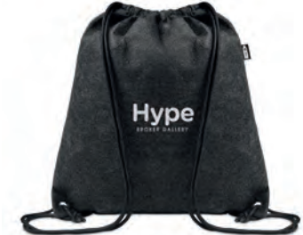
Indico MO6463 RPET felt drawstring bag with polyester cords.