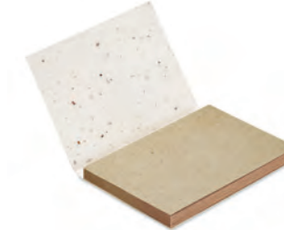
Grow Me MO6234

Eco-friendly Grow Me sticky notes memo pad. Soft wildflower mix seed paper cover. 3 piece sticky note memo pad in grass paper of 25 sheets each. Large and medium sticky notes pads and 3 assorted colours page markers. After recording your thoughts on the last sheet, plant the cover and watch it grow into a wildflower meadow. Made in EU.