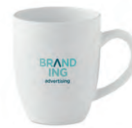
Trent KC7063 Ceramic mug of 300 ml capacity. Presented in an individual corrugated carton gift box.