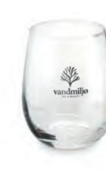
Bless MO6158 Reusable stemless glass presented in gift box. Capacity: 420 ml.