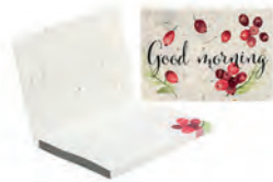
SNCS50 Soft cover made of recycled paper containing coffee waste (size 100x72mm, closed) with 50 sticky notes of recycled paper (80gsm) and recycled offset paper bottom sheet (160gsm).