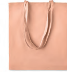
Zimde Colour MO6189

Certified organic cotton shopping bag with long handles. A classic tote bag design made to carry your daily groceries or other items. Carry the bag in your hands or over your shoulder with the long handles. Made from 100% natural organic cotton 140 gr/m 2 .