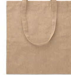
Cottonel Duo MO9424

50% Recycled cotton dye denim and 50% cotton shopping bag with long handles. 250 gr/m 2 .