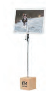
Hello Clip MO9947 Photo/memo clip holder with pine wooden stand. Wood is a natural product, there may be slight variations in colour and size per item, which can affect the final decoration outcome.