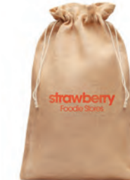
Jute Large MO9930

Large gift jute draw cord bag. Size approx. 30 x 47cm.