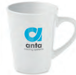
Taza MO8831 Ceramic mug of 180 ml capacity. Individual packing in white carton box. Pad printing is not dishwasher safe. Ceramic transfer is dishwasher safe.