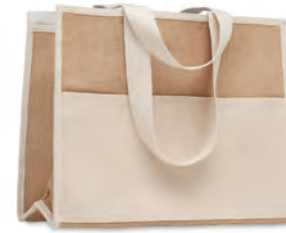
Campo De Geli MO6160

Jute shopping and cooler bag with long handles, laminated and with hook and loop closure, front with canvas pocket and cotton webbing.