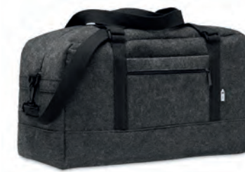
Indico Bag MO6457 RPET felt sports/fitness or weekend bag with zippered front pocket, canvas handles and detachable adjustable shoulder strap.