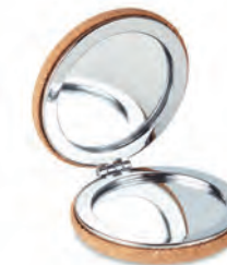
Guapa Cork MO9799

Manual fan in wood with cork fabric sheeting.