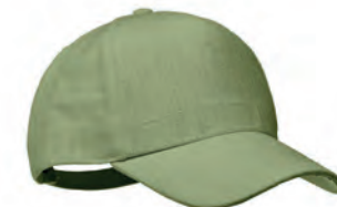
Naima Cap MO6176 5 panel baseball cap in 100% hemp fabric 370 gr/m 2 with brass clips on adjustable strap closure. 5 stitched eyelets in matching colour. Size 7 1/4.