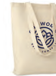
Fresa Soft MO9639

Re-usable food bag. One side is in cotton (140gr/m 2 ) and other one is in mesh cotton (110gr/m 2 ). Drawstring closure. Produced under a certified standard for the use of harmful substances in textile.