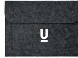
Pouchlo MO9818 Documents bag or 15 inch laptop pouch in RPET felt, 2mm thick, with front pocket and hook and loop closing.