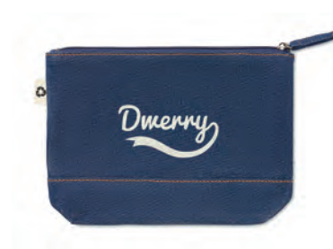
Style Pouch MO6421

2 tone recycled cotton and recycled polyester shopping bag with long handles. Approx. 140 gr/m 2 . This item can shrink after printing.