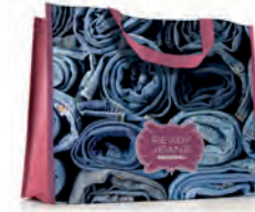
MO4070 Horizontal shopping bag with long self material or PP webbing handles.