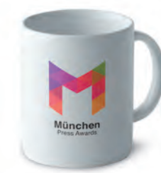
Dublin KC7062 Classic cylindrical ceramic mug of 300 ml mug. Individual packaging in corrugated carton gift box. For full colour process printing, please contact us for pricing.