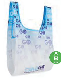
MB1111 Foldable vest shopping bag in 100% RPET with inside pocket. Size: 41x63 cm.