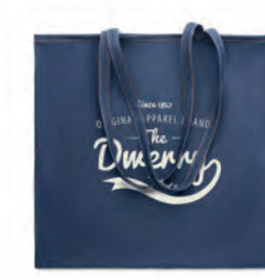
Style Tote MO6420

50% Recycled cotton dye denim and 50% cotton drawstring bag. 250 gr/m 2 .