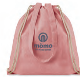
Moira Duo MO9603

2 tone recycled cotton and recycled polyester shopping bag with drawstring and long handles. Approx. 140 gr/m 2 . This item can shrink after printing.