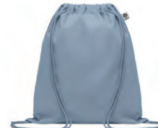
Yuki Colour MO6355

Organic cotton medium food storage bag. 140 gr/m 2 .