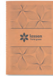
Mid Paper Book MO9867

A5 recycled carton cover notebook. Sewn. 160 plain recycled paper pages (80 sheets).