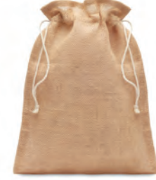
Jute Small MO9928

Medium gift jute draw cord bag. Size approx. 25 x 32cm.