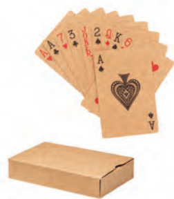
Aruba + MO6201 Recycled paper classic playing cards in a paper box. 54 cards.