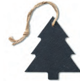
Slatetree CX1433 Slate hanger tree shaped with cord hanger.