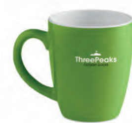
Colour Trent MO9242 Ceramic coloured mug of 290 ml capacity. Presented in an individual corrugated carton gift box.