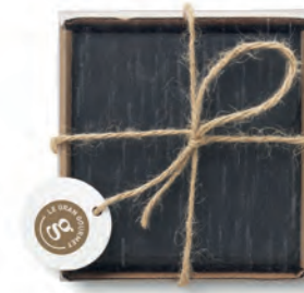
Slate4 MO9124 Set of 4 coasters made of slate with EVA bottom.