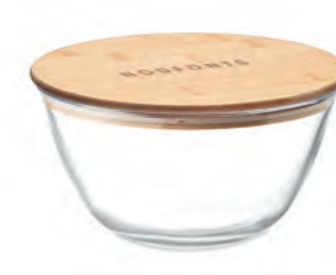
Salabam MO6314 Salad/storage box in borosilicate glass with bamboo lid and silicone band. Capacity: 1200 ml.