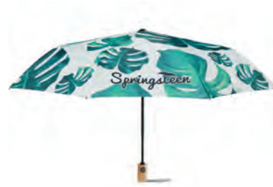
MU2006 MU2006 3 fold, 21 inch (dia. 95cm) umbrella with wooden handle. Black plated shaft, fiberglass ribs. Automatic opening and closure.