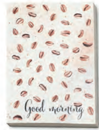
NOPCC5 A5 notebook with soft cover made of recycled paper containing coffee waste.