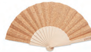
Fanny Cork MO6232

Beach slippers with cork and EVA sole and PVC straps. Size L fits 40-43.