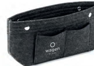
Nazer MO6335 RPET felt travel organizer with 5 inner and 3 outer compartments.