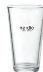
Rongo MO6429 Re-usable Conic glass. Capacity: 300 ml.