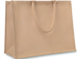
Brick Lane MO8965

Jute laminated shopping or beach bag with cotton handle. Short handles.