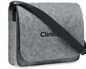
Baglo MO6186 RPET felt messenger or laptop bag with hook and loop closure. Fits a 15 inch laptop.