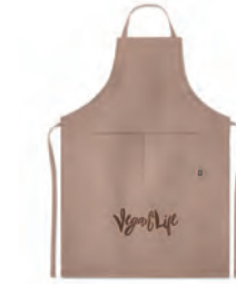
Naima Apron MO6164 Adjustable kitchen apron with 2 front pockets in 100% hemp fabric. 200 gr/m 2 .