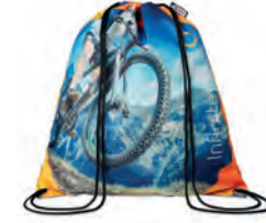
MB3111 RPET Drawstring bag