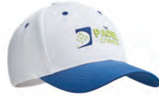
MH2101 MH2101 Recycled PET fabric Cap.