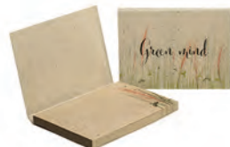
SNGG50 SNGG50 Grass paper soft cover with grass paper sticky notes.