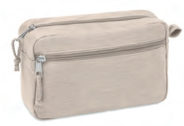
Naima Cosmetic MO6165 Cosmetic bag with double zipper. 100% hemp fabric. 200 gr/m 2 .