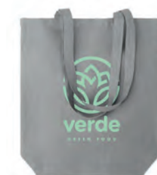
Naima Tote MO6162 100% hemp fabric shopping bag with long handles with gusset in the bottom. 200 gr/m 2 .