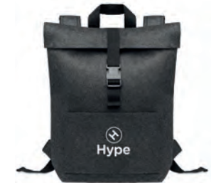
Indico Pack MO6456 RPET felt backpack with cotton strap closure and zippered pocket on the front. It has a laptop compartment.