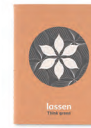
Mini Paper Book MO9868

A5 recycled carton cover notebook. Sewn. 160 plain recycled paper pages (80 sheets).