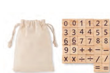
Educount MO6398 Wood educational counting game in cotton pouch. Includes 32 pieces.