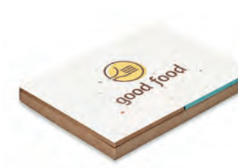
Grow Me MO6235

Bamboo cover notebook with matching pen. Twin-wire. 140 plain recycled paper pages (70 sheets). Matching push button ball pen with bamboo barrel and ABS details. Elastic pen holder.