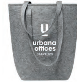
Taslo MO6185 RPET felt shopping bag with long handles and bottom gussets.